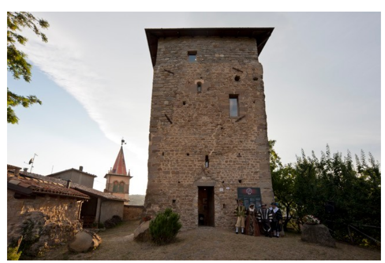
Tower of Montecenere, Lama Mocogno