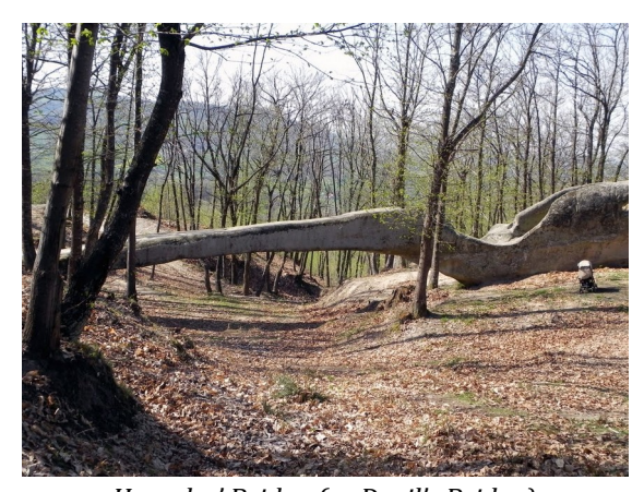
Hercules' Bridge (or Devil's Bridge)

Lama Mocogno is at an altitude of 842 metres above sea level, on a ridge parting two valleys: Scoltenna valley and the river basin of Rossenna. The names of both rivers are etruscan, linked to the domination of that ancient people coming from Tuscany, before the roman conquer.