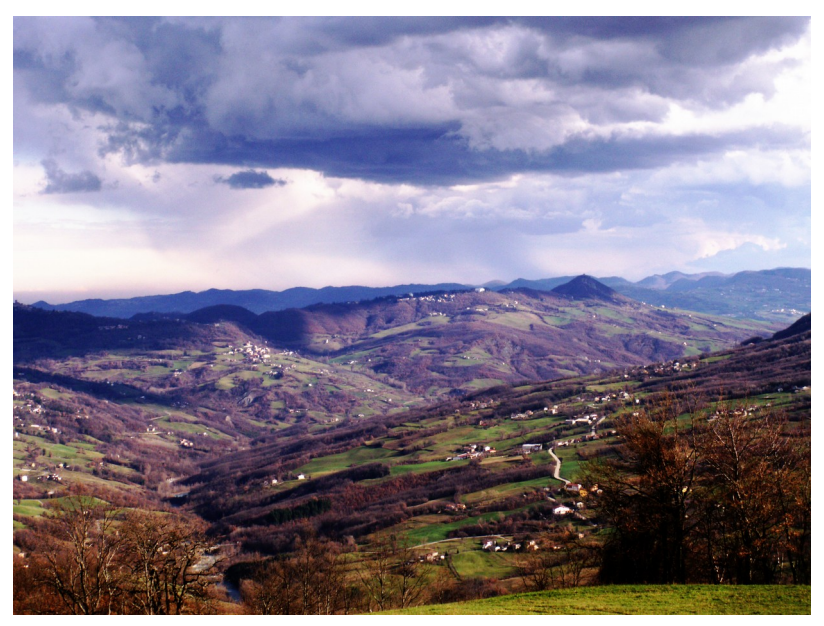
Scoltenna valley, photo taken from Lama Mocogno