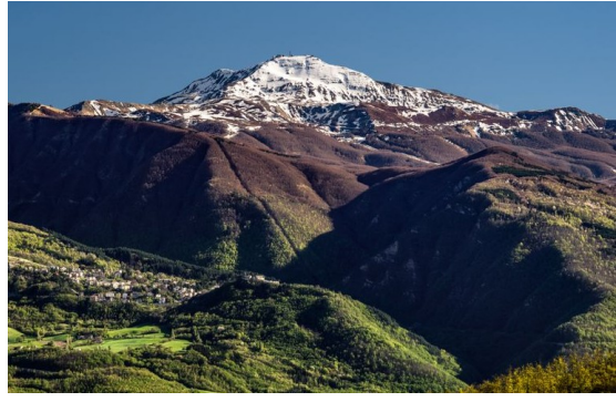
Monte Cimone, photo taken from Lama Mocogno

Lama Mocogno's territory, dominated by Monte Cimone (2165 metres), the highest summit in Emilia Romagna and Northern Appennines, is diversely wooded, since its altitude varies from the 500 metres of ancient Campore mill, in Valdalbero, on the bank of river Scoltenna, to the 1617 metres of Monte Cantiere and the 1300 of Barigazzo village: oak and chestnut trees forests, beechwoods and pine forests are inhabited by foxes, boars and roebucks, while meadows and fields provide forage for the cows, whose milk is used to produce Parmigiano Reggiano cheese by cooperative dairy "Beato Marco" of Mocogno.