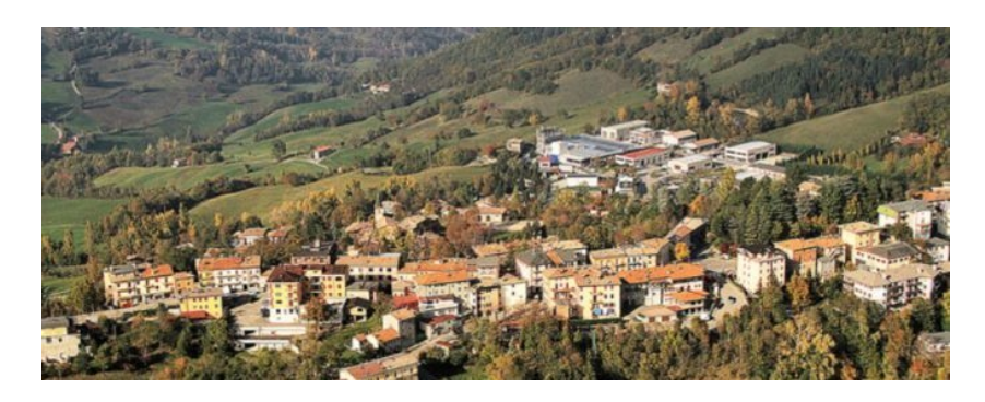
Lama Mocogno, the council town

Many walks are available in the area's many pathways, exspecially in La Santona, Barigazzo, Le Piane, but the most important surely is that of the daring Via Vandelli, built in the 18th century by the homonymous mathematician to connect the capital of the Duchy, Modena, with its only outlet on the sea, in Massa, Tuscany. This road, with the via Giardini-Ximenes which replaced it in economical and strategical importance, created the conditions for the developement of the mountains of Frignano and of actual council town Lama Mocogno.