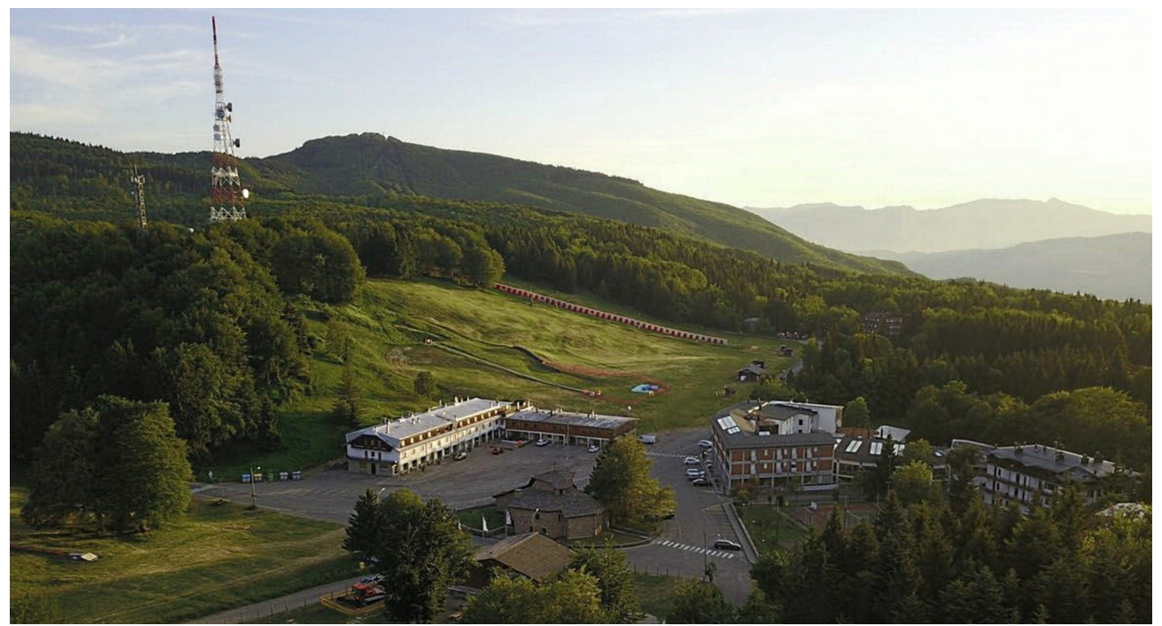
Piane di Mocogno

Archeological excavations, made in last decades, permitted to find roman coins, ceramic fragments, bricks and tiles, mainly in Hercules Bridge area, next to Mount Apollo (Monte Apollo, or Poggio Pennone) and near the high plateau of "Piane di Mocogno", at around 1200 meters above sea level, known in the past as "Piana delle Are" (Plateau of the Altars) allegedly in reason of the presence of pagan shrines. Piane di Mocogno, once a place for sheperds and horse-breeders, is now a well renowned cross-country skiing centre (Centro Federale FISI Lama Mocogno), dominated by Monte Cantiere (1617 meters).